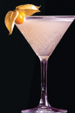
PINEAPPLE & LYCHEE DAIQUIRI