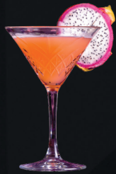
✳️ KISS OF THE DRAGON £7.95