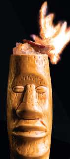
PASSION FRUIT ZOMBIE