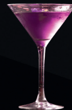
VIOLET MARTINI £8.95