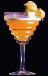
XANTE SIDECAR £7.95